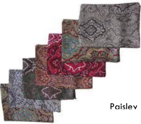
Paisley Pure Silk Scarves