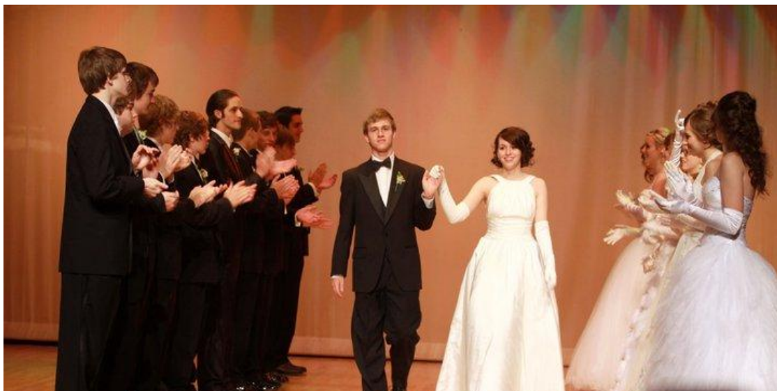
Below: Rose Rock Students perform the Virginia Reel

Rose Rock Cotillion is an etiquette program designed for teens in the South Central Oklahoma area. Students are taught social skills, graces, modern day etiquette and table manners, as well as ballroom dance in a fun and engaging environment. The program is currently a spring program and classes are available for junior high and high school students. Please add Rose Rock Cotillion as friend on Facebook for updates and information regarding cotillion for younger age groups.