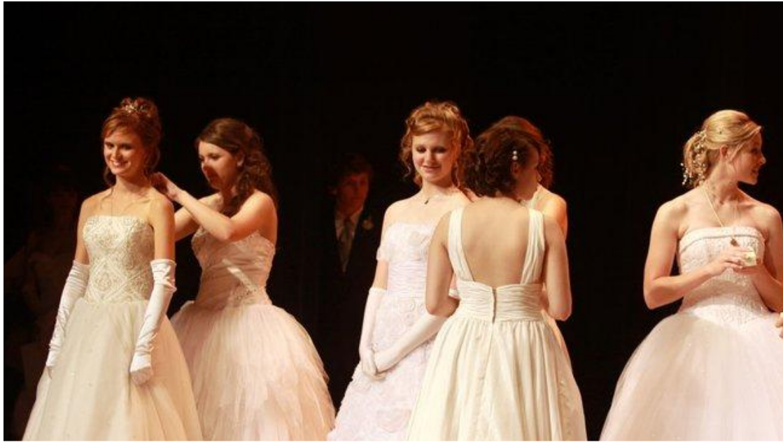
Above: Rose Rock Cotillion Alumni present new members with a Rose Rock necklace.