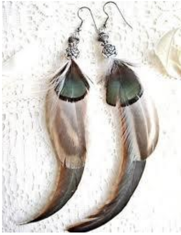
Natural Feather earrings made locally